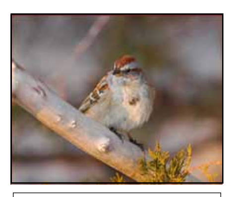
In South Dakota, we know winter is coming when we see the American Tree Sparrow show up in their favorite brushy areas. Hughes County, SD. 3/25/06