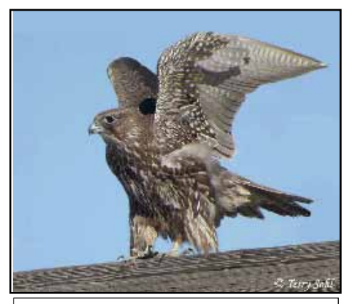
Gyrfalcons have been reliable in central South Dakota for several years now. The new National Geographic Guide shows the Pierre area as a wintering ground. Lyman, County, SD. 2/16/04