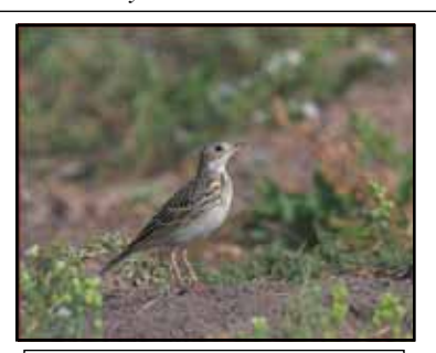
Sprague's Pipits have been found recently in the autumn on the banks of War Creek near the Richland Wildlife Area in the Ft. Pierre National Grasslands; Jones County, SD. 9/11/05