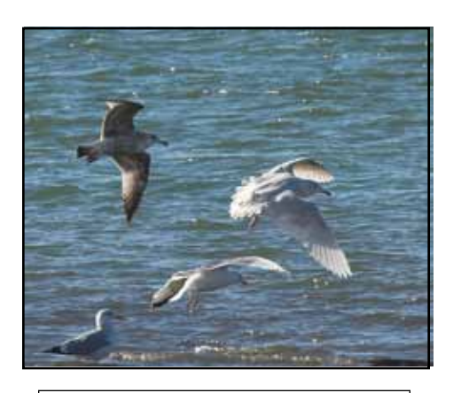
This Iceland Gull (flying, top right) with several Herring Gulls, was present at LaFramboise Island Causeway, Hughes County, SD, 2/11/06.