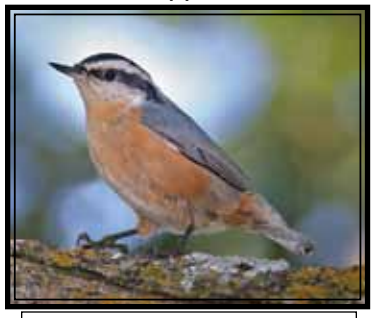
Red-breasted Nuthatch Lincoln County, SD. 9/07/07

s I write this communication in early December, I am convinced that an irruption of Redbreasted Nuthatches (RBNH in bird banding parlance) is occurring. In my back yard, we have counted four individual birds together at the feeders. In the last four or five years, we have had one and occasionally two RBNHs in the yard. In prior seasons, the appearance of a Red-breasted Nuthatch