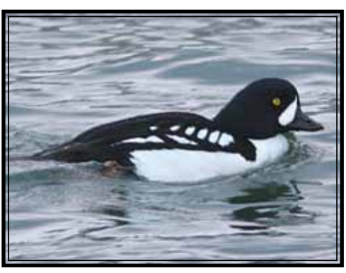
In South Dakota, we know winter is coming when the Barrow's Goldeneye is back on Canyon Lake in Rapid City. Pennington County, SD. 1/10/04