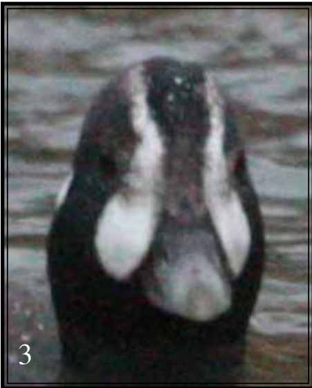
Harlequin Duck female. Canyon Lake, Rapid City, Pennington County.