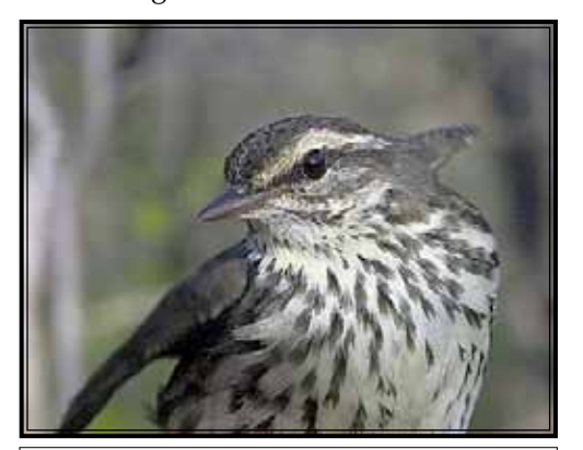
Northern Waterthrush

are singing! In Rice Co., MN, Louisiana Waterthrushes breed near limestone cliffs along the Cannon River. Northern Waterthrushes are migrants that breed