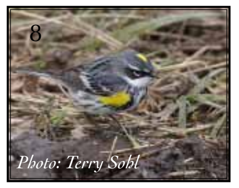
A heartfelt thank you to all the photographers in SD and elsewhere who allow us to print their incredible photos of birds in South Dakota Bird Notes. Thanks very much to all of you. ~ the editor