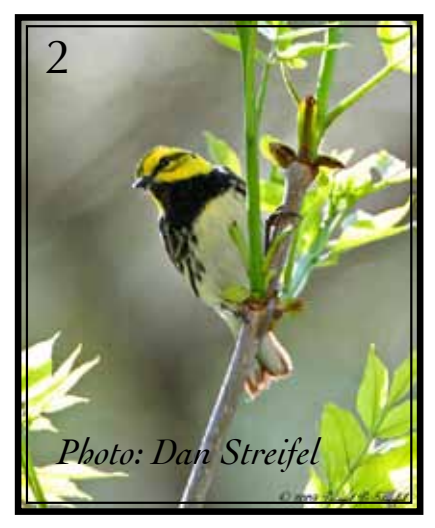
1. Northern Pintail. 2. Black-throated Green Warbler. 3. bler. 4. Lark Bunting. 5. Trumpeter Swan. 6. Chestnut-Clay-colored Sparrow. 8. Yellow-rumped Warbler (Myrtle See the complete list of species seen at the meeting