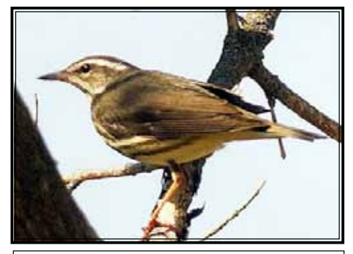
Louisiana Waterhtrush I.