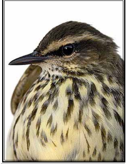
Northern Waterthrush I Photo: Dan Tallman

farther north and usually are not singing. The Northern Waterthrush song ends in a diagnostic "chew-chew-chew." The Louisiana song begins with three clear slurred whistles, followed by a number of twittering notes dropping in pitch (Peterson 1947). Thayer Birding Software graciously allowed me to use their copyrighted mp3 files of bird calls so that you can listen to the songs of the Louisiana Waterthrush and the