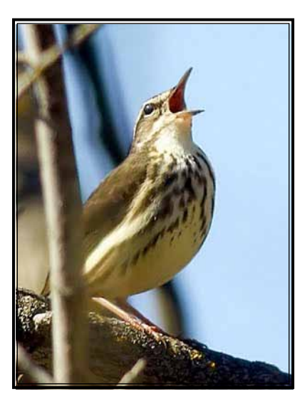
Louisiana Waterthrush II