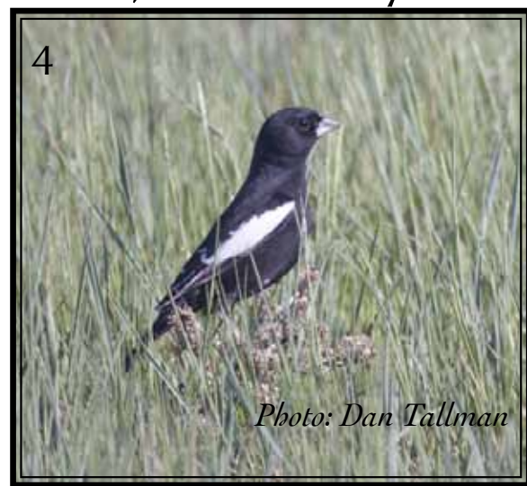
Black-and-white Warcollared Longspur. 7. e ssp.). ig on page 32.