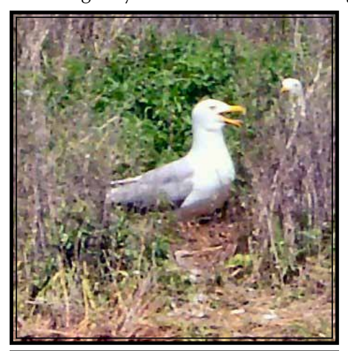
Adult Herring Gull at Nest, Hughes County.

I experienced some apprehensive excitement on this outing, as five unexpected adult Herring Gulls were also present on the large island. This inspired me to look diligently for evidence of a Herring Gull nesting. After about an hour of