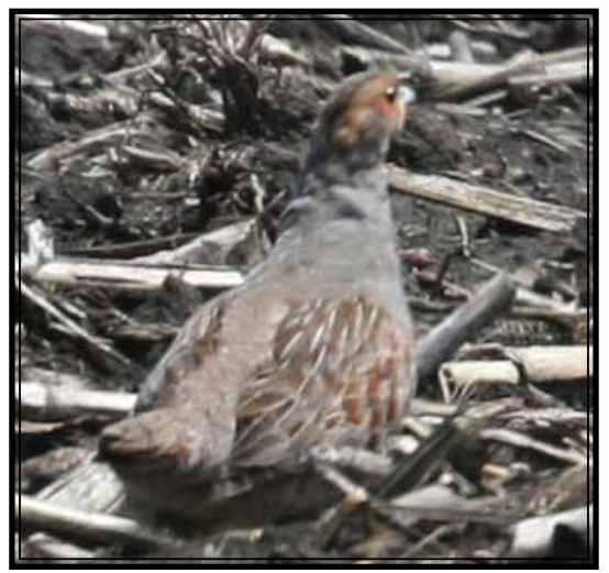
Gray Partridge, 10/14/08 Lincoln County

The weather in 2012 was dry and warmer than normal. By early June, grasshoppers were abundant. These conditions apparently led to good nesting success in