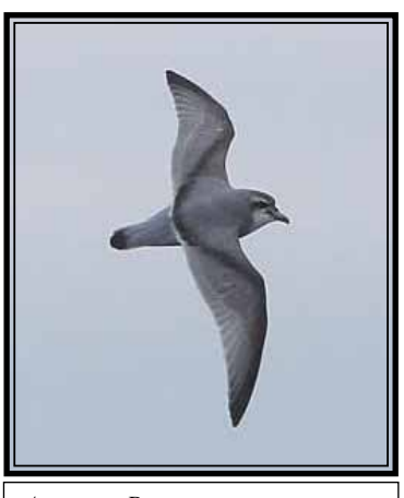
Antarctic Prion South Atlantic Ocean, 02/2008

Happily, he confined the volume to the petrels, albatrosses and storm-petrels of North America. The book is excellent. While it uses photos, rather than painted illustrations, it largely overcomes the "one bird at one moment in time" problem by using multiple photos. Photos can be problematic as bird illustrations, since they show an instantaneous view of