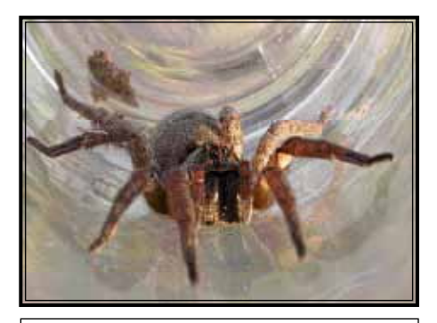
A captured burrowing wolf spider. Stanley County, SD.

Long-billed Curlews are the earliest upland shorebirds to return to the grasslands in central South Dakota, sometimes arriving in late March, usually 3-4 weeks before Upland Sandpipers and 2-3 weeks before Marbled Godwits, based on my observations. The food source of burrowing wolf spiders appears to be abundant in early spring and may explain why Long-billed Cur-