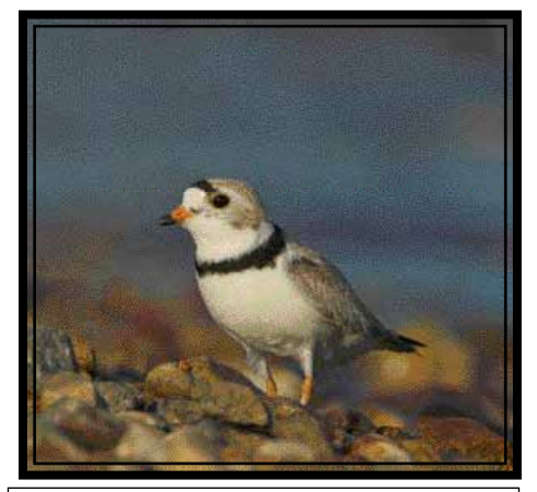
Piping Plover on its favorite foraging habitat—rocky shores. Hughes County, SD.

It was during one of these cool summer mornings when the mastermind