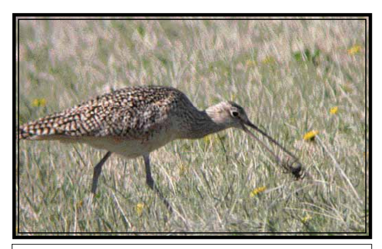
Long-billed Curlew eating a burrowing wolf spider just dug from a burrow. Stanley County, SD.

I returned on 25 April and again observed Long-billed Curlews foraging by probing in burrows. The first bird I watched caught three spiders in ten minutes. Another pair I observed for twenty-three minutes caught at least three spiders. I located another Long-billed Curlew and watched it for twenty minutes;