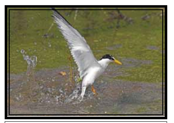
Least Tern taking off. These endangered birds are fairly common along the Missouri. Hughes County, SD.

y family owns a small cabin on the Missouri River, and it didn't take me too long to realize what a birding haven it is. During the late summer months when the spring flooding subsides, our family takes a couple of kayaking trips with family and friends. Paddling downstream from a number of launch sites upriver, we spend entire mornings, afternoons, or