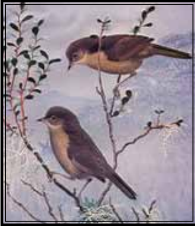
Pardusco: "Little Brown Thing."